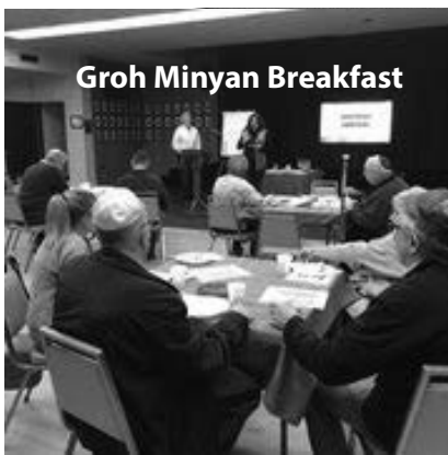
Groh Minyan Breakfast