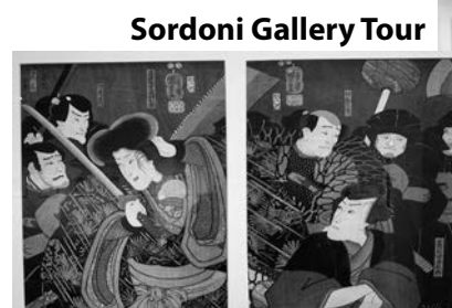
Sordoni Gallery Tour