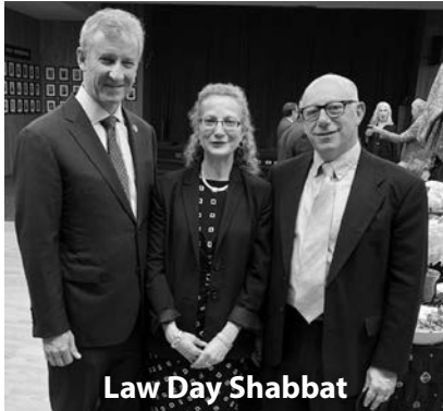
Law Day Shabbat