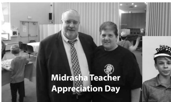
Midrasha Teacher Appreciation Day