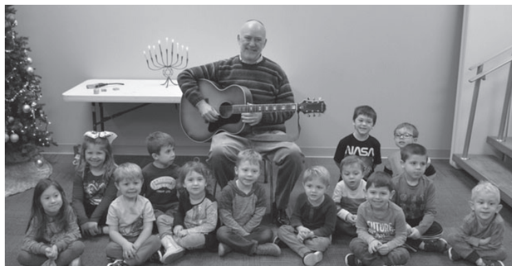
Cantor leading a Chanukah program at the Wyoming Valley Children's Association